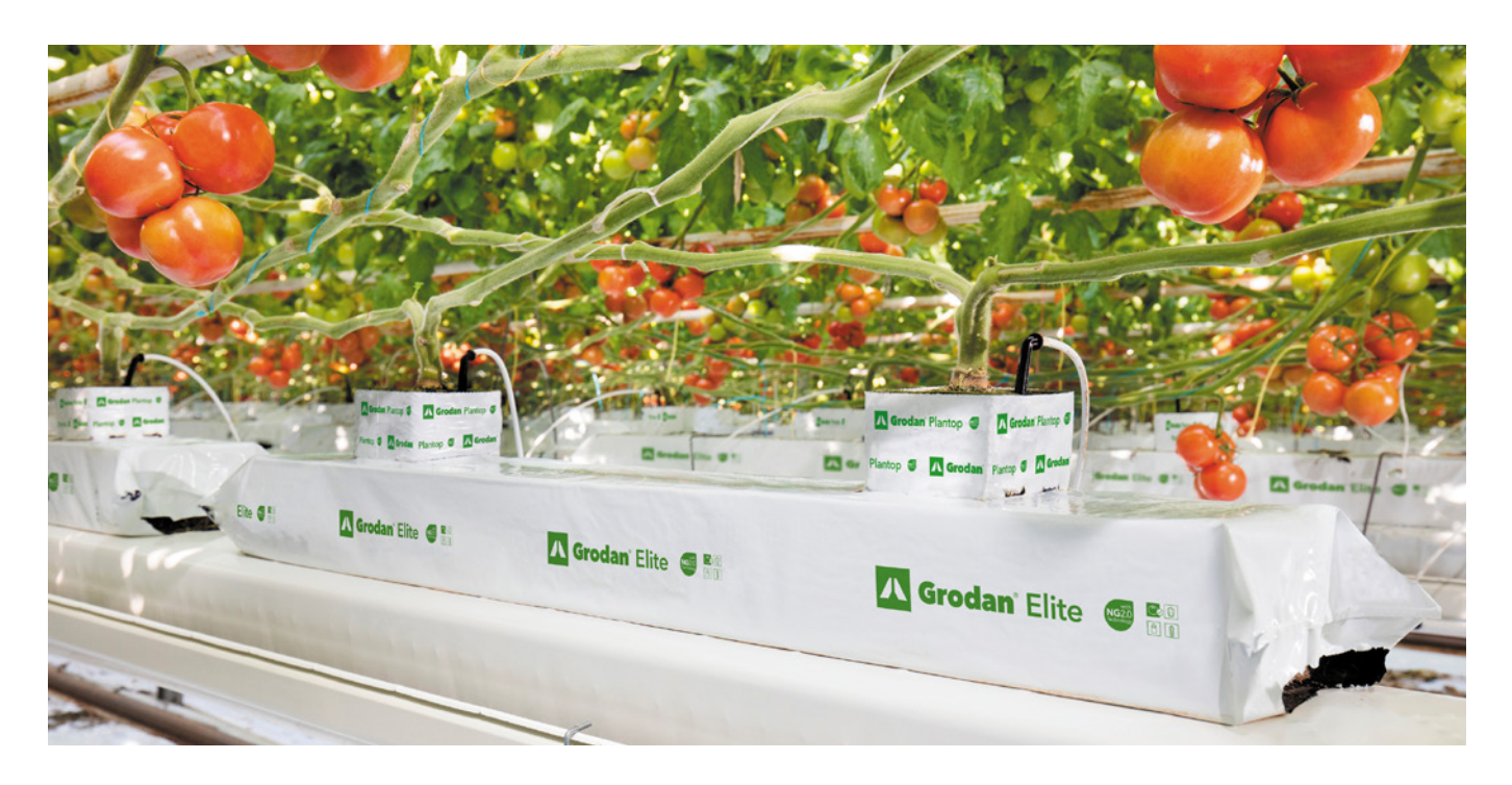
> Figure: Water content (WC) and electrical conductivity (EC) are essential measurements for healthy plants and fruits. Shown here: the GroSens measuring system from Grodan.

Weekly sampling of substrate and drain nutrient levels is important, especially two weeks before and after the first harvest. Focus on maintaining the correct potassium levels in the substrate (e.g. for tomatoes it is 6-8 mMol/l). Samples should come back from the laboratory within days because nutrient levels can quickly become unbalanced.